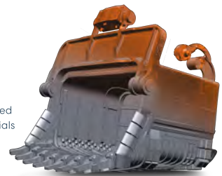
Parametric solid model created in Geomagic Design X Essentials

If you can design in CAD, you can start using Geomagic Design X Essentials right away. It's fully-renewed user interface and workflow tools make it easier than ever before to quickly and accurately create as-designed and as-built 3D CAD and model data.